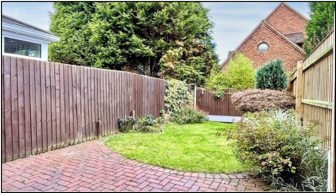
Juniper Close, Sutton Coldfield, B76 1SR